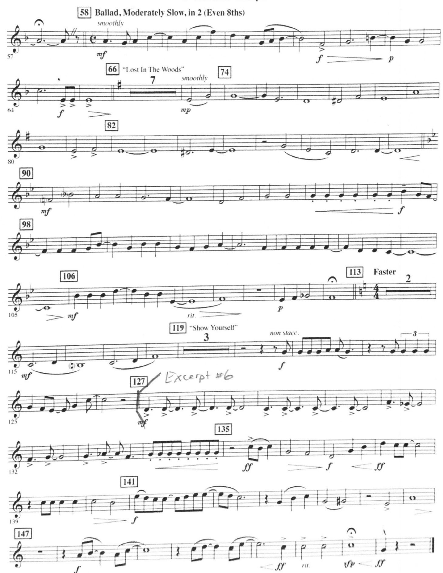
PART 2 B<sup>|</sup> Clarinet/B<sup>|</sup> Trumpet