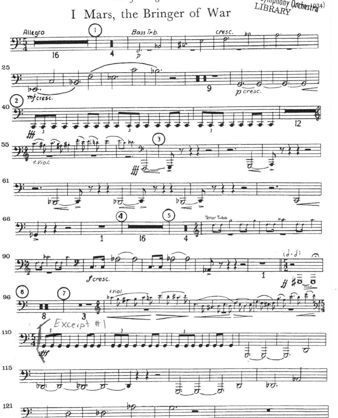
Copyright © 1921 by J. Curwen & Sons This edition copyright © 1979 by J. Curwen & Sons (ASCAP)

Johnstown Symphony Onether 1034) LIBRARY